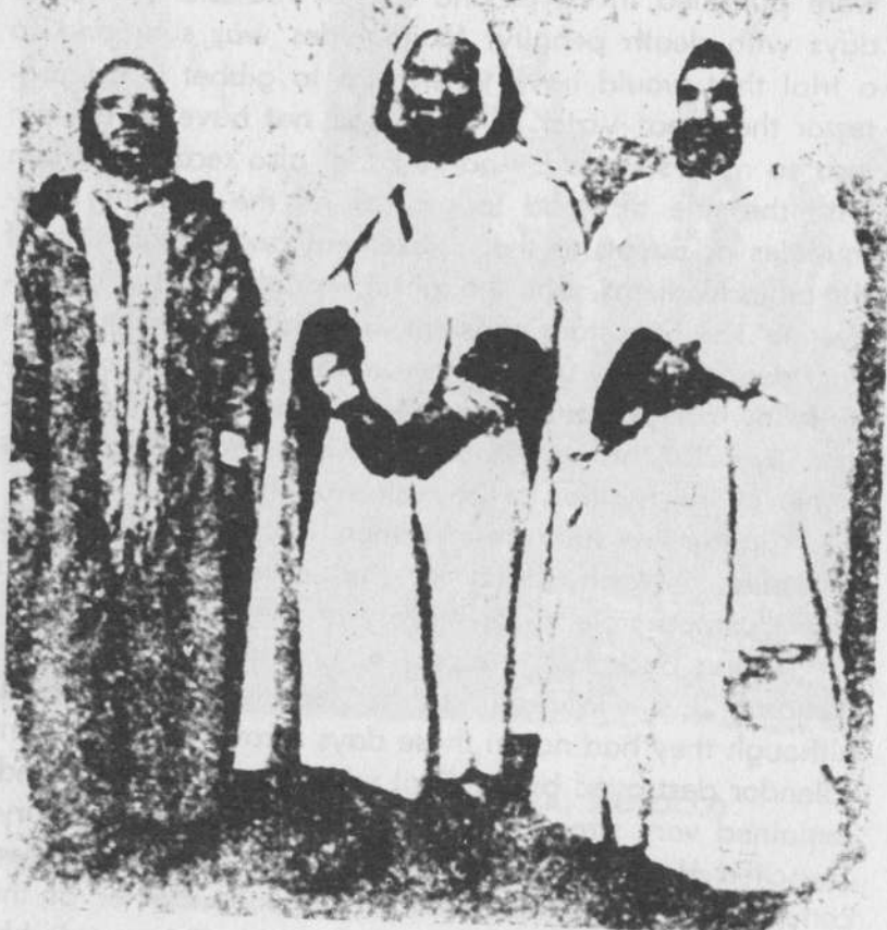
BERBER JEWS OF MOROCCO.

Photo taken of the great Jewish work titled: " Castilian Jewish Encyclopedia " 7th vol. Mexico, D. F. 1950. Word Morocco. p. 302, 2nd. col.