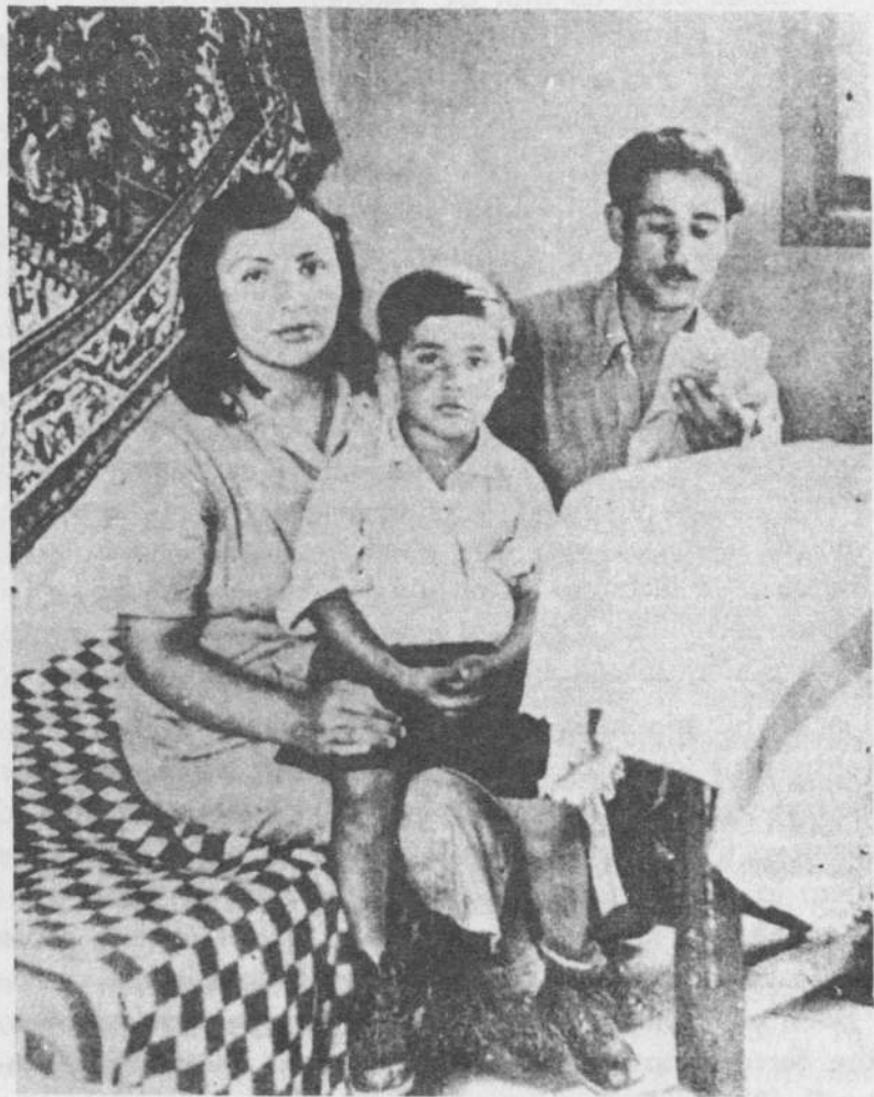
MARRANO FAMILY; THIS IS TO SAY CLANDESTINE JEWS, OF IRAN. THEY ARE PIOUS MOSLEMS IN PUBLIC AND JEWS IN SECRET.

Photo taken from the Great Jewish work titled: " Castilian Jewish Encyclopedia ". Additional volume titled " Contemporary Judaism ". Mexico, D. F. 1961. Word Marrano. p. 878, 1st. col. MODERN MARRANISM.