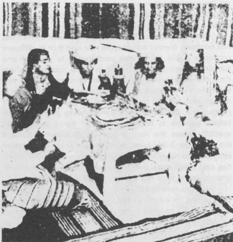
RITUAL FAMILY BANQUET OF YEMEN JEWS OF THE MIDDLE CLASS.

Solemn ceremonies and rites have given and continue to give Judaism a great internal strength. They are of a synagogue or familiar character, according to if they are performed in the bosom of the Synagogue Fraternities or in the family. Ceremonies use to end with a Ritual Banquet in which every plate and every meal has a symbolic meaning. Masonic Banquets — like everything in Masonry — are mere copies of those celebrated in the secret of Judaism. For the gentiles to know about these RITUAL BANQUETS the Jewish books call them DINNER PARTIES, to hide the real meaning in Judaism.