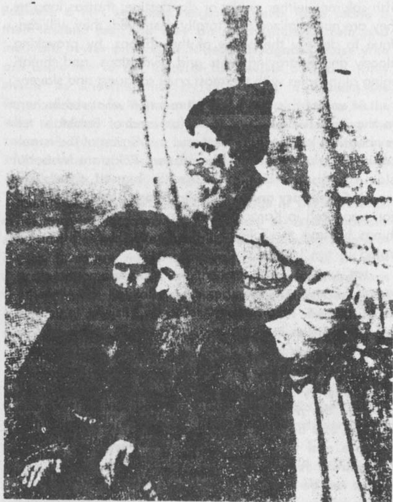
JEWISH TYPES FROM CAUCASUS.

Jewish authors say that the cradle of the Caucasian Hebrews was in Aturpakatan, called Soviet Azerbaidjan today. They have spread into Georgia — Stalin's homeland — Turkey and especially in the Caucasus. Many of them are Moslem in public and Jews in secret, in Turkey.