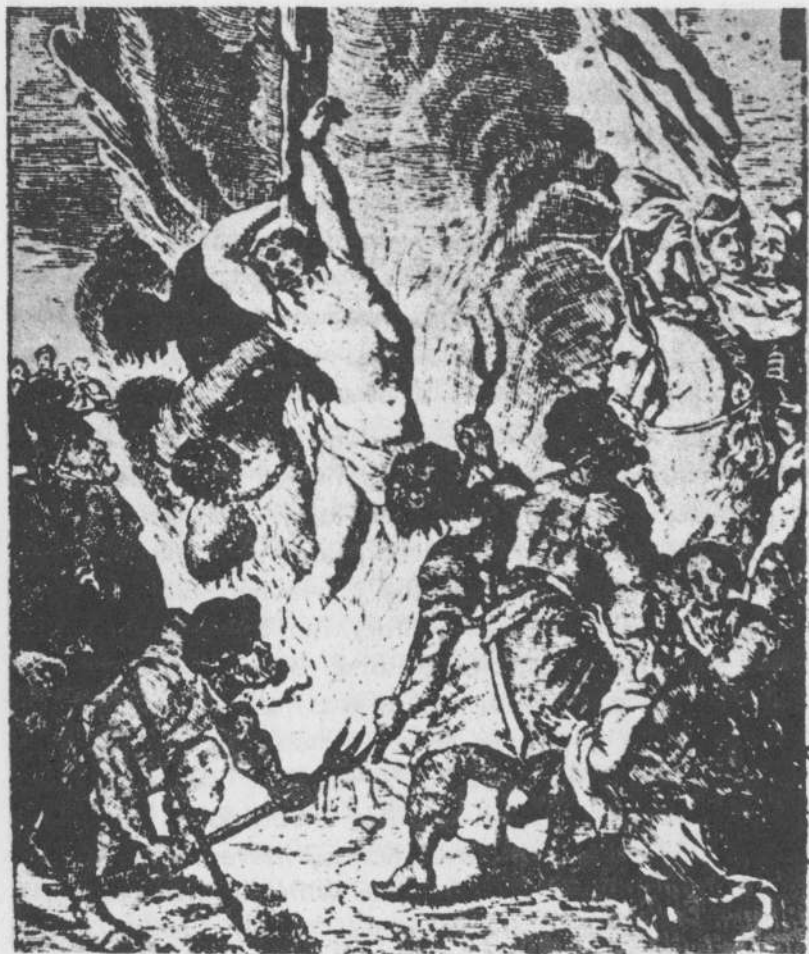
CLANDESTINE JEWS BURNED ALIVE BY THE PONTIFICAL MEDIEVAL INQUISITION.

They were Christians in public and Jews in secret. They were condemned for going to Mass and take communion as Christians, and keep the wafers taking them out of the mouth to profane them. 1370.