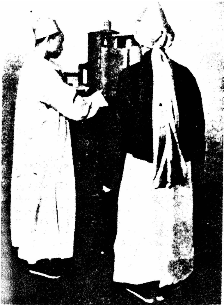
CHINESE JEWS AT THE CEREMONY OF READING THE TORAH