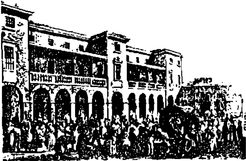
New Arcade and Market Place St. Peter's c. 1840

The story of how the Island of Guernsey created its own money, without cost to the taxpayer, and established a prosperous community free of debt.