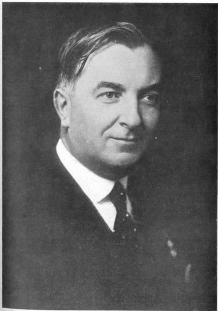
H. E. LUIGI FEDERZONI, Minister of the Colonies.