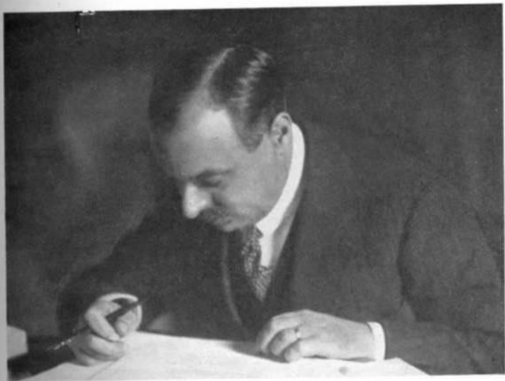
HIS EXCELLENCY SIGNOR ALFREDO ROCCO, Minister of Justice.