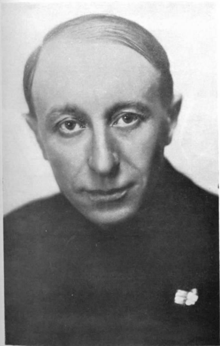
AUGUSTO TURATI, Secretary of the Fascist Party.